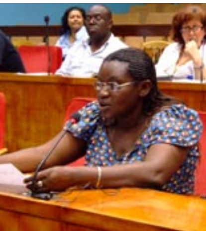
CAURWA's education coordinator addressing the African Commission on Human and Peoples' Rights about the violations of the Twa's rights to identity and freedom of association in Rwanda.