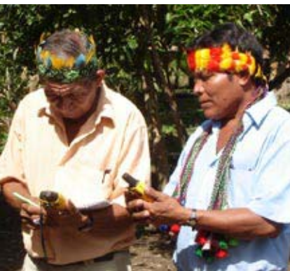
Above: The crude oil pumped up from under the jungle of River Corrientes comes up mixed with hot salty water full of heavy metals. These 'production waters' are pumped straight into the streams that feed the River Corrientes.