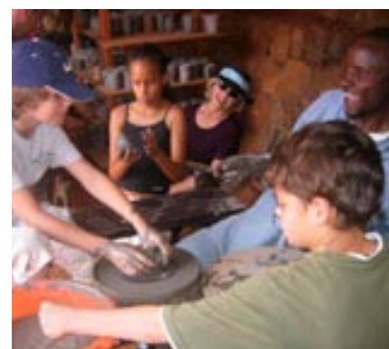
Above: A Twa potter from the Runda cooperative.