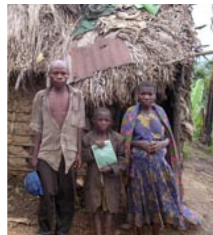
This Twa family at Senzoga, Uganda, will be built a new house under UOBDU's pilot housing project.